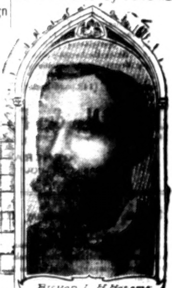
The Bishop's Strong Tribute to Pe-ru-na

Having Tried Many Remedies and Failed to Find a Cure, Tried Pe-ru-na and Was Promptly Relieved.